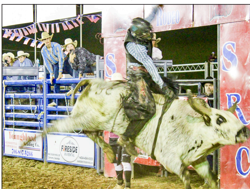
A bull rider holds on as onlookers marvel at the fierce action on display at the 2023 Hiwassee Pro Rodeo Saturday, Sept. 2.

By Daysha Pandolph Towns County Herald Staff Writer