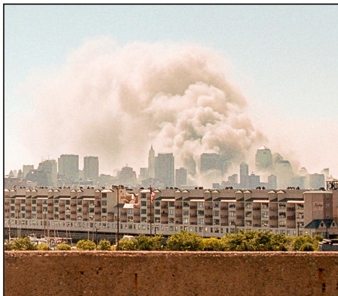
Smoke rises from the site of the World Trade Center in New York City, September 11, 2001.